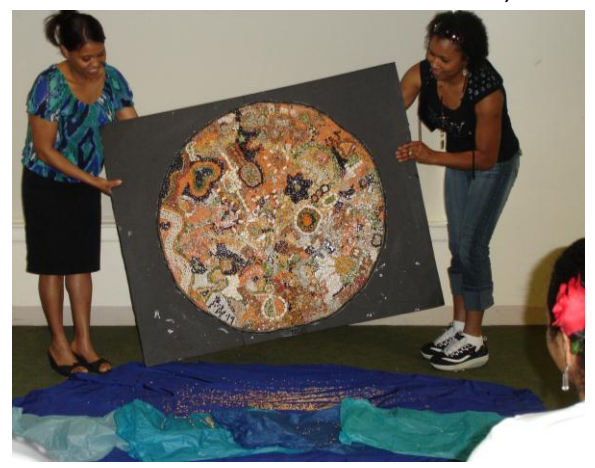
Hanging the finished mandala and letting the beans fall

beans, split peas and others) were placed around the circle. Instructions (see below) were placed near the table. Students could sit at the table, work quietly, and add to the emerging design. Because