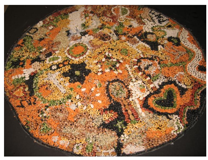
Detail of finished mandala